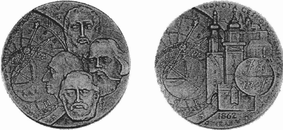
The 125th anniversary Commemorative Medal

In 1987 the 125th anniversary of the Union was celebrated in Prague. The Czechoslovak Mail released three postage stamps, and the Union released a Commemorative Medal that has been used ever since.